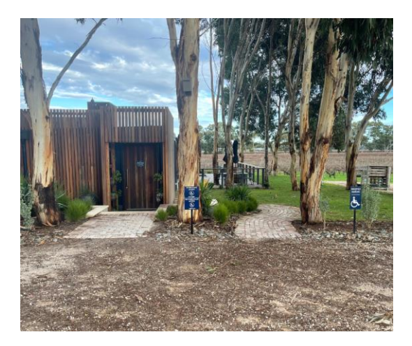
Signage at cellar door Error! Bookmark not defined.